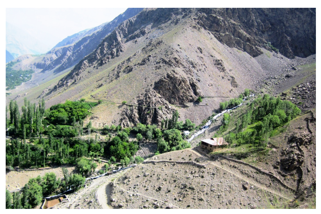
Photo 2: Water source and irrigation canal in the mountain gorge, Porshinev, GBAO, Tajikistan.

In general, there is no separate monitoring of the resource condition in Porshinev so the violation or destruction of the resource is inspected on ad hoc basis during rehabilitation or irrigation activities. The monitoring of appropriators behavior on the communities level is dispersed among WUA staff like mirob <sup>10</sup> (master of water), mirjuy's and fellow water users. The activeness of water users monitoring depends on the village location and water shortage severity and conducted on rotation basis either individually or in groups. The effect of monitoring by the assigned mirjuy's and mirob is meager as they have no enough resources, strong credibility, widespread agreed arrangements and accurate information for rules enforcement. On the other hand the individuals hardly manage to make continuous monitoring of water flow in canals of several kilometers length. Consequently a sort of twofold monitoring system of water use has emerged where a minor role of mirjuy's and the mirob is supplemented by inter and intra village monitoring of fellow water users. Sensibly, such double check approach supposed to ensure more effectiveness and security but in reality chaotic, biased and inconsistent implementation does not successfully prevent the incidence of violation and conflicts.