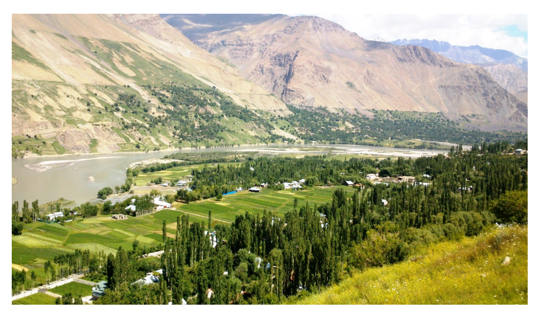
Photo 1: Landscape and local land use. Porshinev, GBAO, Tajikistan.

Due to low levels of precipitation in recent years (Wood et al. 2009), Hokimbek spring now dries up earlier, leaving dependent 38 households without water in the middle of irrigation season. Facilitated by WUA the villages served by Tirwethak canal agreed to revise their water schedules and to share water with 38 households who suffer from inadequit water supply. As compensation, the assisted households were requested to contribute labour in future annual rehabilitation of the infrastructure they used in Tirwethak canal. Similarly to previous case, 87 households in Pashor village that share a single spring for irrigation, during water scarcity revise their water distribution practices. To ensure everyone has adequate water supply and to lessen pressure on the spring, 24 households are requested to use water from the river which is compensated by the remaining households in the form of payment for electricity fees accrued from pumping.