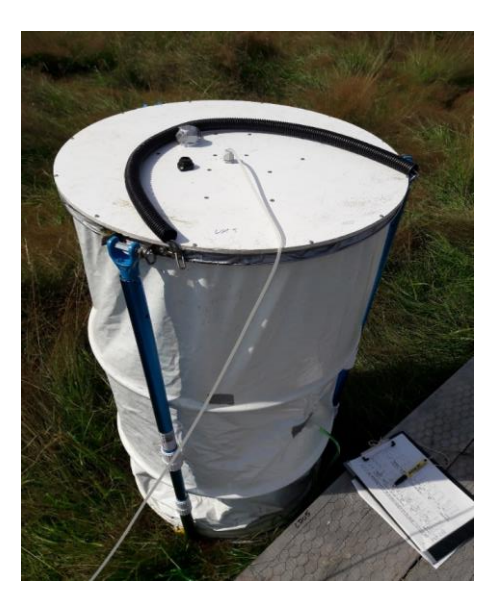
Picture 5. Non transparent chamber for measuring CH<sub>4</sub> concentration

For measuring methane concentration not transparent chambers are used. It connects with gas analyzer by tubes.