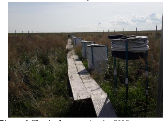
Picture 2 . The site for measuring the GHG concentration in the field Weather stations are installed for taking into account weather conditions (picture 3).

Before measurements, the site is fenced. On areas for measurements round rubber frames with an iron base are installed for the further chambers installation. A wooden bridge is laid for moving that additional release of CH_4 will not provoked.