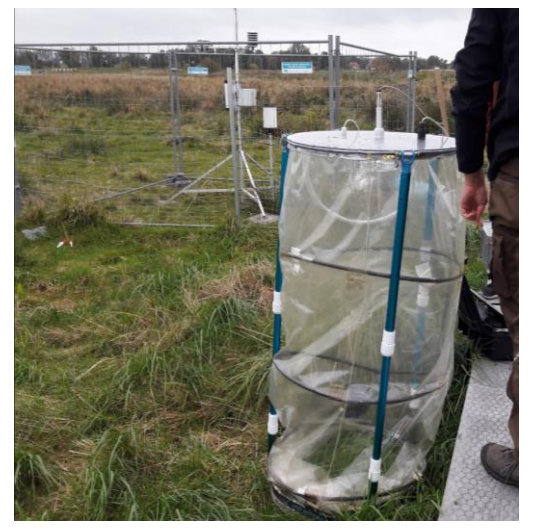
Picture 4. Transparent chamber for measuring of CO<sub>2</sub> concentration

Chambers are installed very nearly to frame.